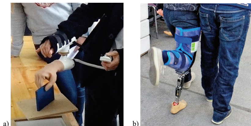
Fig. 4. During „Cybathlon” spectators could try devices for disabled people: a) artificial hand, b) artificial lower leg