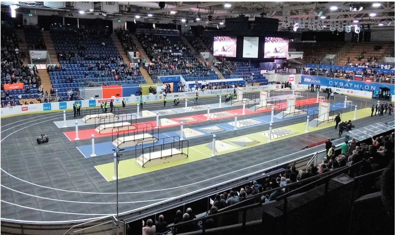
Fig. 1. General view of the „Cybathlon” venue in Zürich

“Cybathlon”, the first international competition for people with disabilities supported by modern assistive technology, took place in Zürich, Switzerland. The Swiss Arena Kloten was the venue for “Cybathlon” (Fig. 1). The competition took place on October 8, 2016 from 10 am to 6 pm.