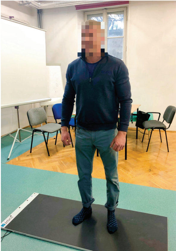
Fig. 1. Patient on a pedobarographic platform

on the platform in a neutral position with their feet hip-width apart. The 30-s tests were performed with both their eyes open and closed. Each study was performed three times and the average result was further analysed [22], [23].