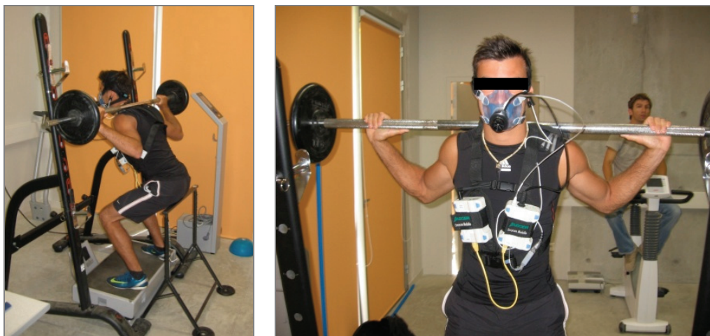
Fig. 2. Experimental Protocol

values were expressed in absolute values (bpm) and in relative values to the empirical theoretical maximal values determined from the following relation: maximal value of HR (bpm) = 220 - \text{age of the subject (year)} [16]. The intensity of the exercises was also quantified in number of the Metabolic Equivalent of Task (MET) [3].