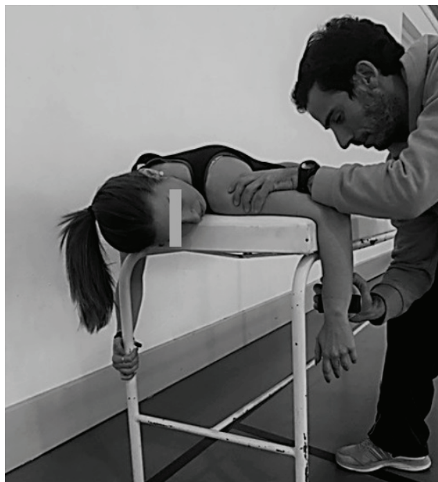
Fig. 2. Shoulder Internal Rotation measurement

The maximal IR and ER isometric strength was evaluated with two repetitions for each shoulder and