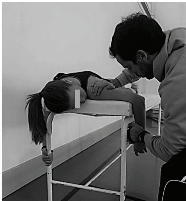
Fig. 1. Shoulder External Rotation measurement

positioning, participants performed a warm-up protocol that consisted of 2 submaximal and 1 maximal isometric contraction in each direction, separated by 30 seconds of rest [25].