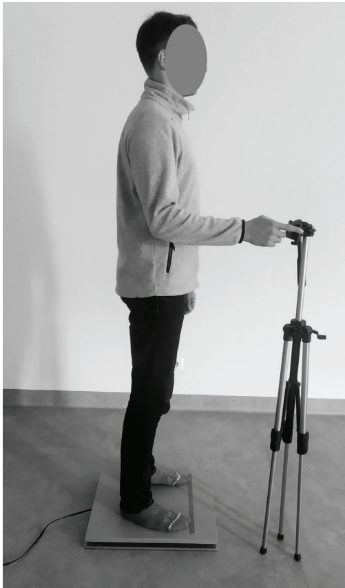
Fig. 1. Experimental setup

Participants stood barefoot on the force platform with their big toes touching the line marked on the platform, feet were parallel, positioned at shoulder width. Participants were asked to stand still as possible in two conditions, with additional tactile information (light touch – LT) and without light touch (NoLT). In each condition, participants were asked to fixate their gaze on a point located 3 m away at their eyes level. In the light touch condition (Fig. 1), participants were instructed to maintain their elbow flexed approximately