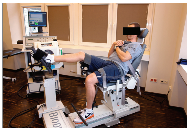
Fig. 1. The measurement of IT using Biodex System 3

Isometric torque (IT) measurements under static conditions of PFM and DFM were performed in both groups using Biodex System 3 from 2011 to 2012 (Fig. 1). Biodex System 3 was produced in the year 2008 and it accommodates measurement and rehabilitation facilities (Manufacturer: Biodex Medical Systems SHIRLEY, N.Y. 11967 USA. Model 333-250. Software – Biodex Advantage) [17].