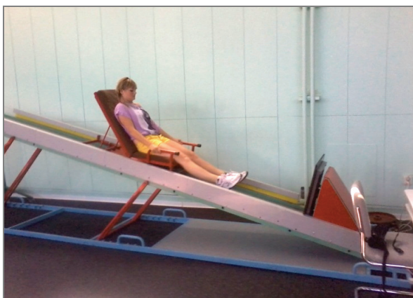
Fig. 1. Stand for power measurement

Each subject was tested twice. During the first training, after a standard warm-up, female students executed 7 series of 10 bounces on the inclined plane. Each series was the following: a student exercised 10 bounces, then she rested for 30 seconds, after break she executed the subsequent 10 bounces and rested for 30 seconds, and so on.